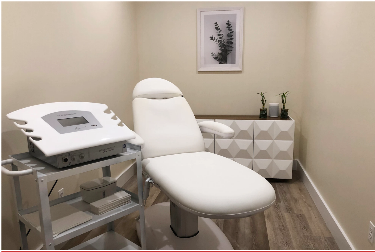
One of the many cutting-edge wellness rooms at the holistic wellness center Organic Edge.