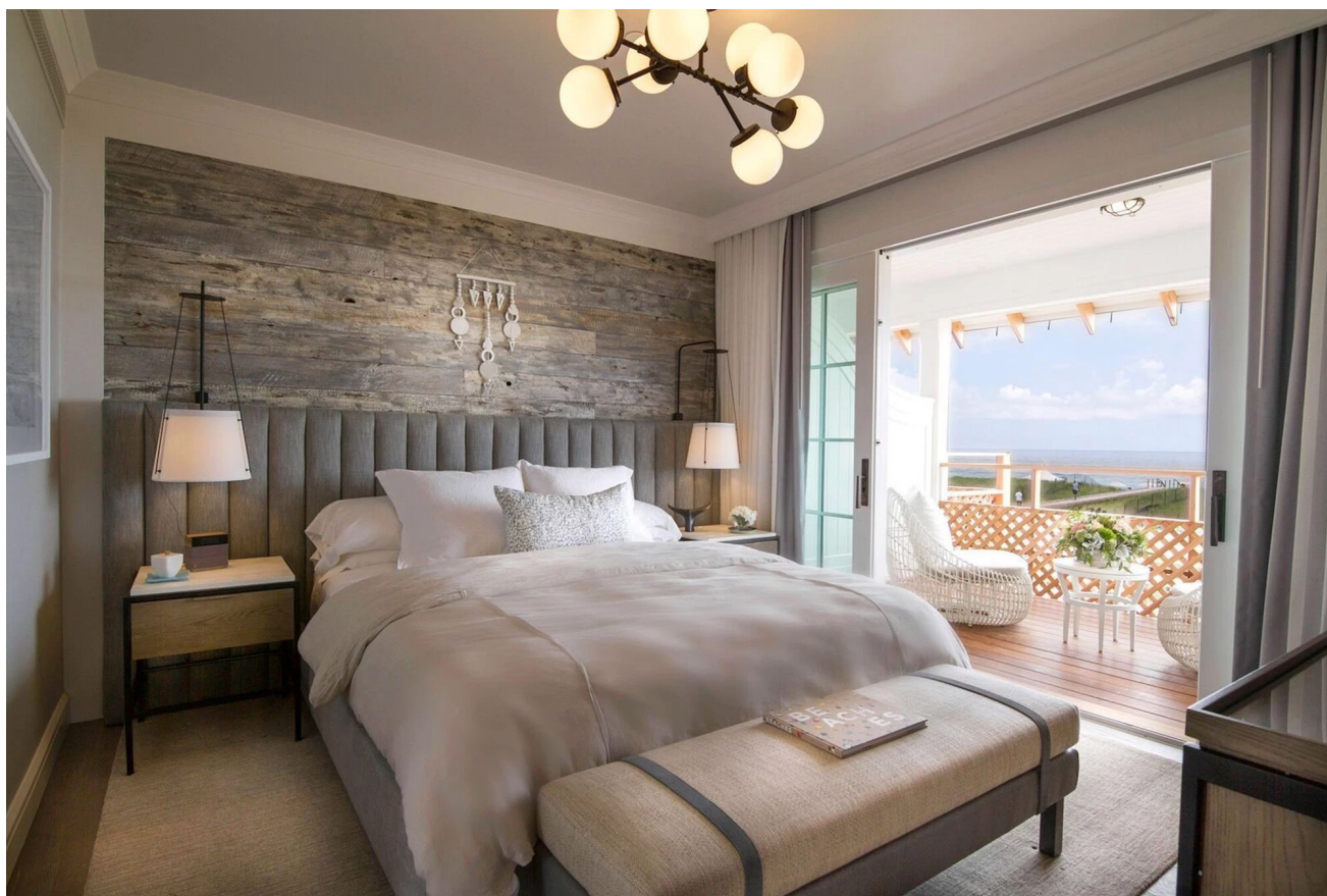
The beach club suite at Dune Deck Beach Club