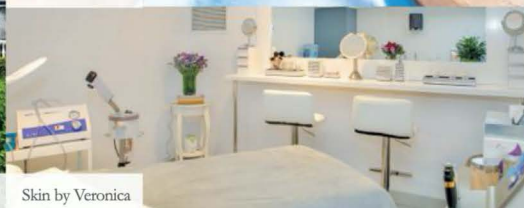
Skin by Veronica