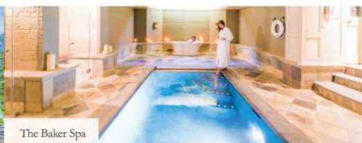
The Baker Spa